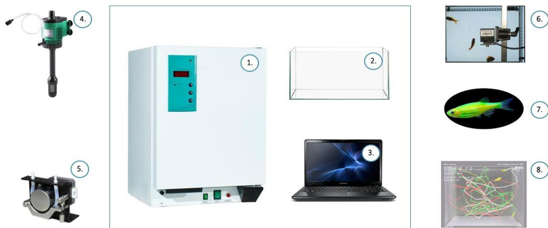
Figure 1 - Components of the TrackTox-Fish bioelectronic water quality registration system

Of considerable interest is the use of fish behavior characteristics as biosensor organisms in the prototype of the TrackTox-Fish biological monitoring system (Figure 1), developed at the Department of Applied Ecology, KFU [23]. The system is designed for continuous monitoring of water quality in both flowing and static modes. Organisms are monitored on-line using computer vision technology implemented in a specialized program [24].