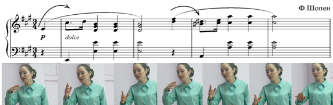
Figure 01. F. Chopin, Prelude 7.

Episode 1. In the work on the Prelude 7 of F. Chopin the expressive movement of the hand reveals the beauty and the airiness of the initial ascending intonation on the 6th interval: