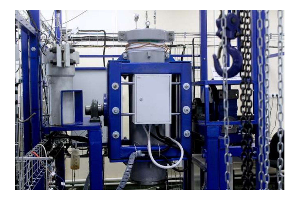
Fig. 1.1 - Picture of the equipment for physico-chemical modeling of the process of steam-assisted gravity drainage

The purpose of the method is to filter the fluid through the oil-saturated rock with an injection agent (hot water, steam) in equipment for physicochemical modeling of the process of steam-assisted gravity drainage (Fig. 1.1) [3].