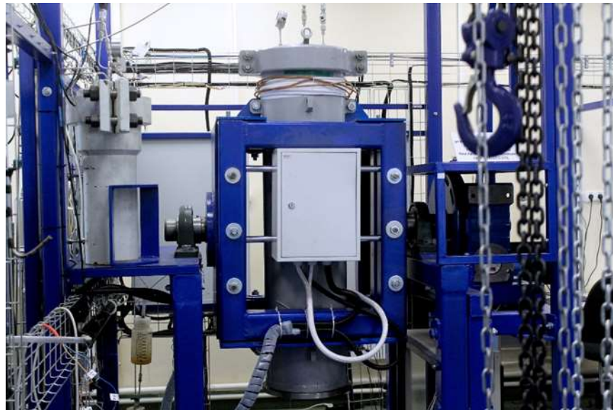
Fig. 1.1 - Picture of the equipment for physico-chemical modeling of the process of steam-assisted gravity drainage

The purpose of the method is to filter the fluid through the oil-saturated rock with an injection agent (hot water, steam) in equipment for physicochemical modeling of the process of steam-assisted gravity drainage (Fig. 1.1) [3].