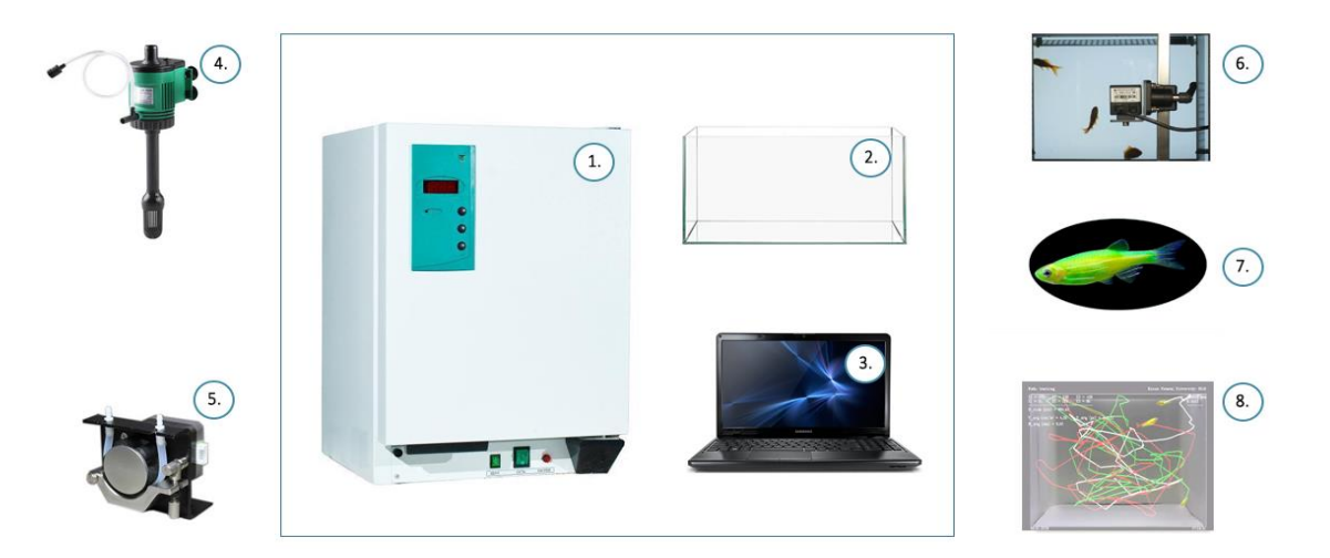
Figure 1 - Components of the TrackTox-Fish bioelectronic water quality registration system

Of considerable interest is the use of fish behavior characteristics as biosensor organisms in the prototype of the TrackTox-Fish biological monitoring system (Figure 1), developed at the Department of Applied Ecology, KFU [23]. The system is designed for continuous monitoring of water quality in both flowing and static modes. Organisms are monitored on-line using computer vision technology implemented in a specialized program [24].