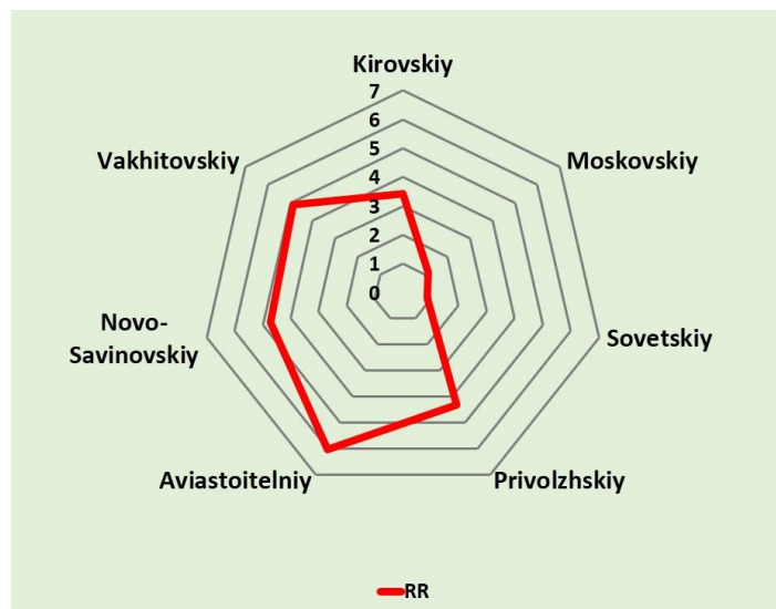
Figure 3: The allocation of a relative risk (RR) of dissemination of intestinal infections in cats as per the districts of Kazan

The evaluation of the RR value proved the low level of risk in Moskovskiy and Sovetskiy districts of Kazan (Figure 3). Statistically significant and high rates were detected in Aviastroitelniy district RR = 6.03 (1.29-28.11), Novo-Savinovskiy district RR = 4.73 (1.03-21.70) and Vakhitovskiy districts RR = 4.88 (1.03-23.07), which proves the high risk level of infectious dissemination of intestinal parasites in cats in these districts (P < 0.05).