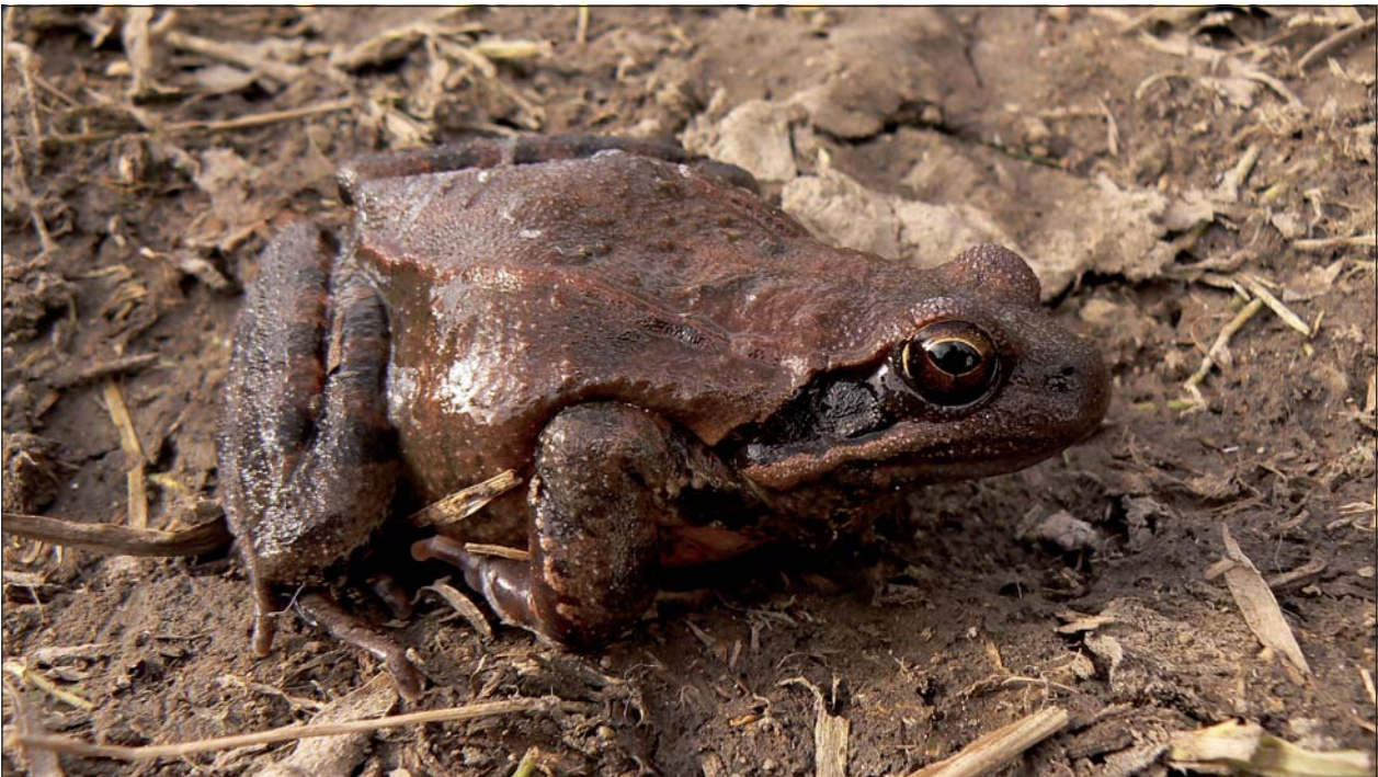
Fig. 2. Adult male of the Hyrcanian frog from Sym village (Astara District, Azerbaijan).

The rate of endosteal resorption varies in different species and during life of individual. After start of sexual maturity, in connection with overall decreasing of growth the processes of resorption decrease or stop. Therefore, adhesion lines, which are not resorbed after start of sexual maturity and formed after it, evidently persist throughout a life of animal. After that, the rate of resorption decreases and almost stops. As a result of the resorp-