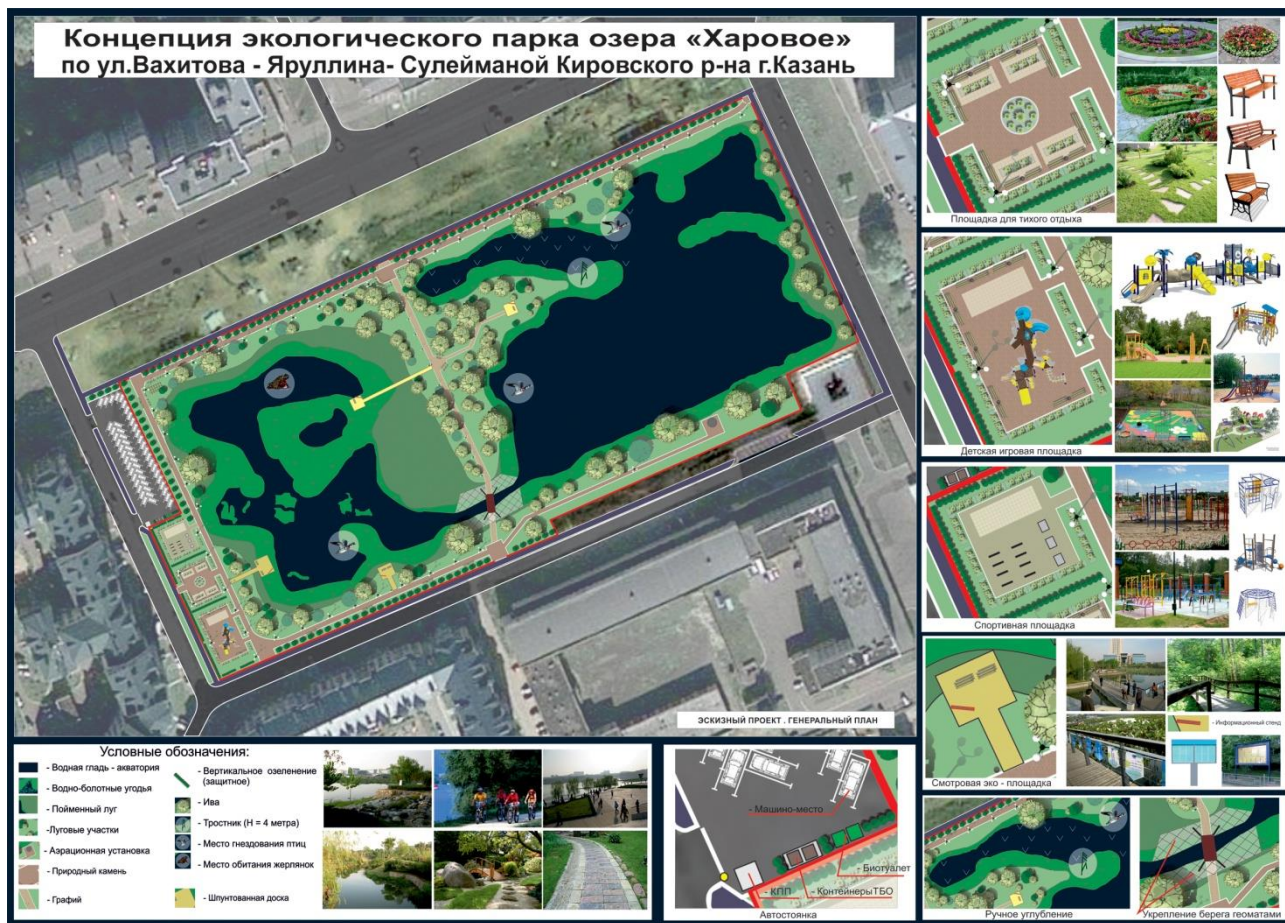
Fig.2. Option conceptual master plan Ecopark Lake Chara